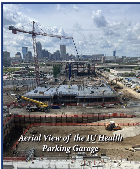
Aerial View of the IU Health Parking Garage

Edco-Evans and Fox are at the Target Distribution Warehouse on Girl School Rd. Reith-Riley has paving jobs all over the city. Walsh, Milestone, Denger, James H. Drew, Specialties, Mt. Carmel Stabilization and E&B are all working around the clock on the I-69 job to have it done by November. E&B is on a bridge