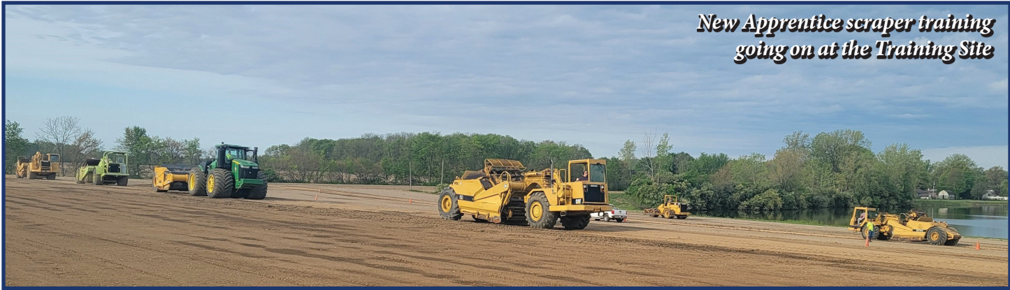
New Apprentice scraper training going on at the Training Site