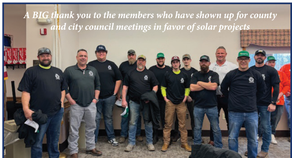
A BIG thank you to the members who have shown up for county and city council meetings in favor of solar projects

Connersville Ambulatory Hospital has provided a small number of members with working hours. Skanska, the construction manager on the project, is typically good with Unions but has chosen to use many non-union contractors on this project. Local 103 has partnered with surrounding Locals, Trades, and the Building and Wood