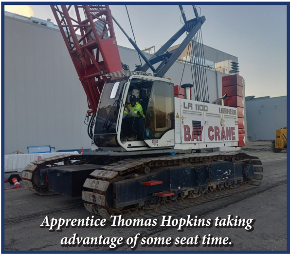
Apprentice Thomas Hopkins taking advantage of some seat time.

I want to wish everyone safe travels on their daily adventures! And don't forget if you see solar signs, please reach out to an agent, so they can look into these projects as they pop up, often times unannounced. If you have spare time, we need NCCCO operators!