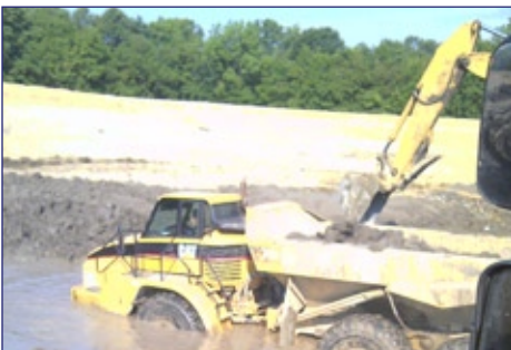
Fox struggling with the rain on SR 31 in Kokomo

Fox Contractors is keeping several members busy at the Liberty Landfill in Buffalo. We were able to secure this work with Fox using the Target Fund. It looked like it was going to be awarded to a non-union contractor from Michigan. E&B and Deichman are working on 6 th Street in Monticello and should be there into next season.