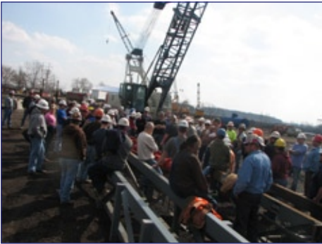
Great turnout for hammer and lead class