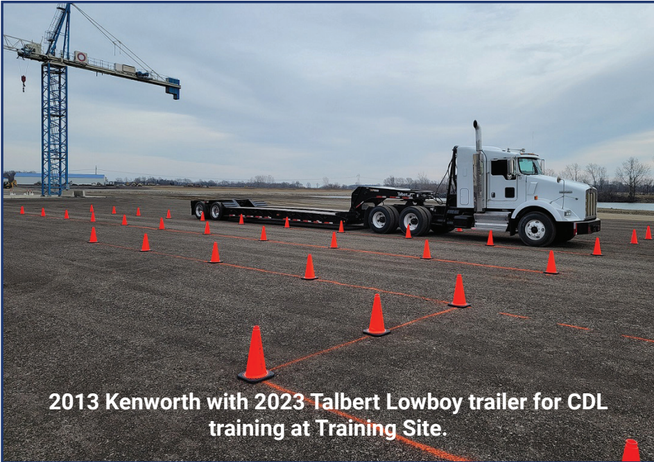
2013 Kenworth with 2023 Talbert Lowboy trailer for CDL training at Training Site.

the western district are open! We have several jobs that will be trying to work thru the winter months and several more to kick off in the spring. Current work going on in the area include: multiple housing additions, Klondike School, storm water CSO Storage on South River Road. Teal Road, Oak Dale Dam, Cross Roads Ph II, Hardy Hill Solar Farm, and the I 65 road project.