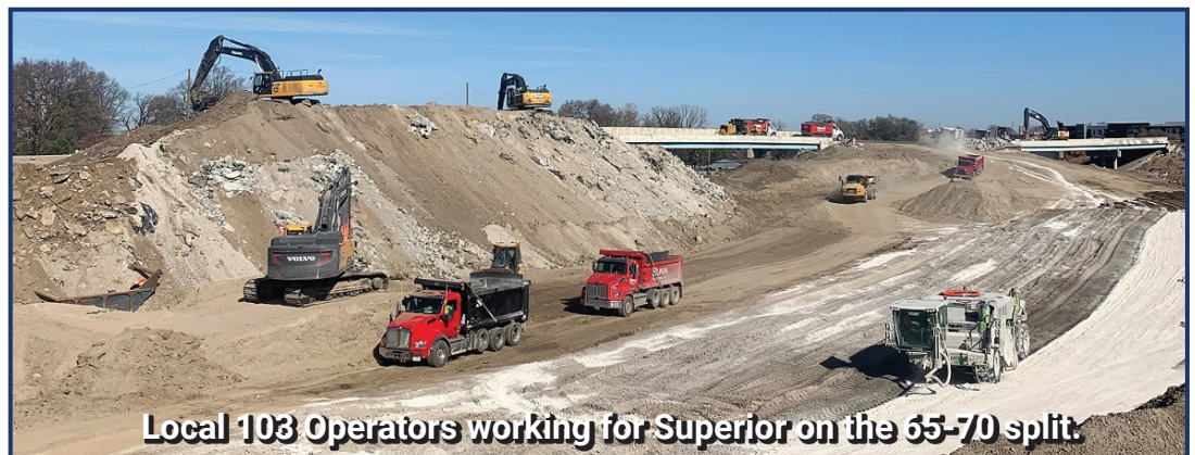
Local 103 Operators working for Superior on the 65-70 split.

There is going to be a new bridge over Allisonville Road at 176th St. with a round-a-bout underneath. The project hasn't been let yet but United Construction is in the process of demolishing 13 houses, and Tri-State Forestry is clearing the area in advance of the startup. Fox is working at 106th St and Lantern Road, and a housing