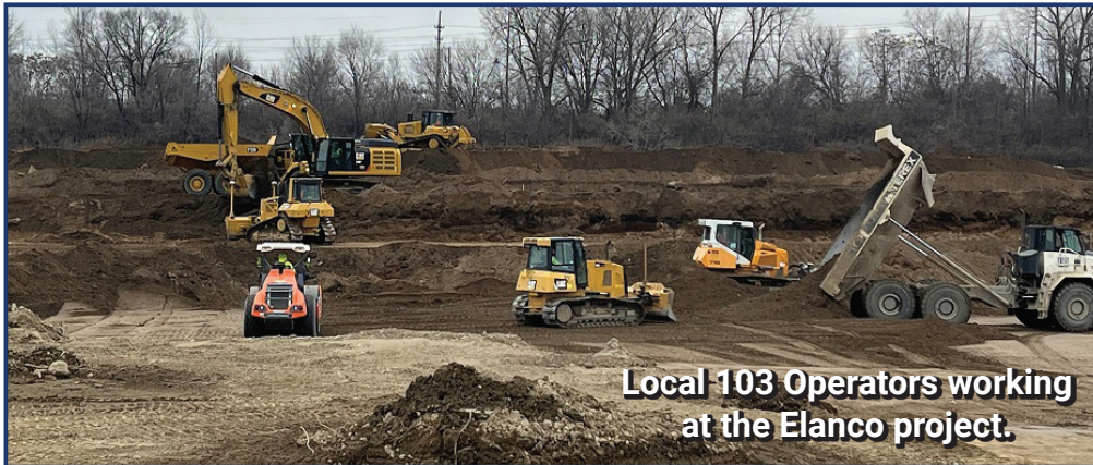
Local 103 Operators working at the Elanco project.

Bowen has numerous sites for tunnel work along Fall Creek. Fox has been digging a new cell at the Morristown Landfill. Milestone is starting on the other side of the new bridge over 65 at Emerson Ave. Groundbreakers, GLS, and US Hydrovac have all added many new trucks to their fleets this year.