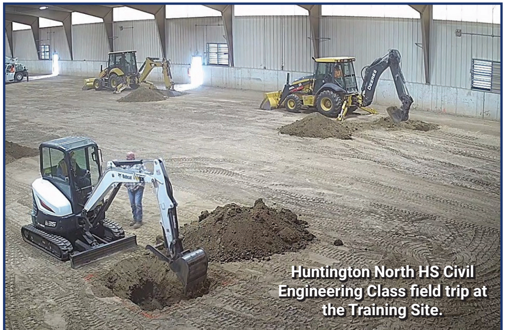
Huntington North HS Civil Engineering Class field trip at the Training Site.