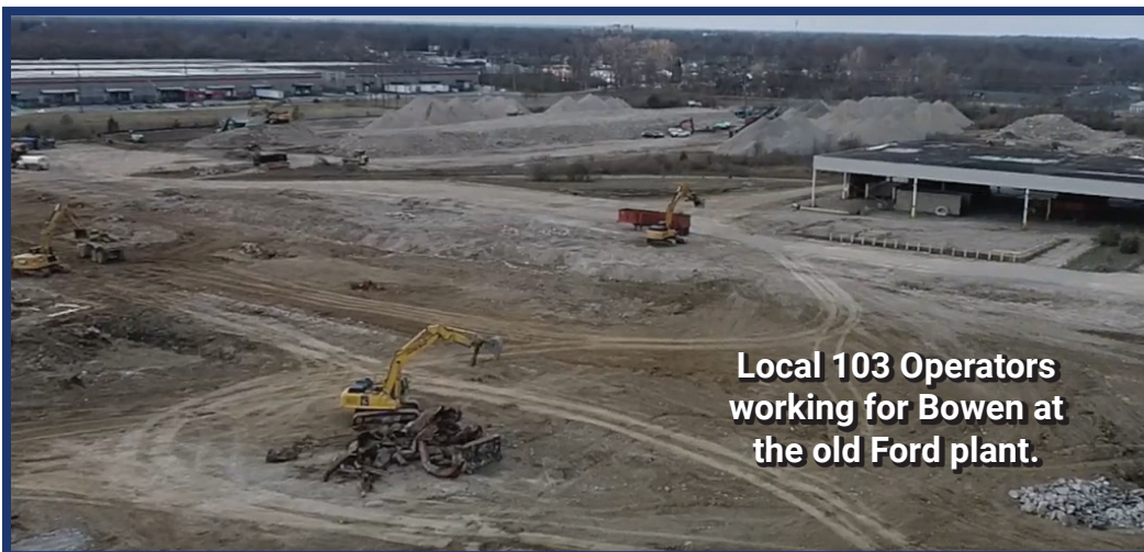
Local 103 Operators working for Bowen at the old Ford plant.

There have been several new plans let on box buildings in the same area. Wilhelm is doing two parking garages at the Criminal Justice Center, and some other miscellaneous buildings. Wilhelm also has numerous sites on the east side digging tunnels and shafts. Super Excavators is in town doing a bore for them at Pleasant Run. Crider, Calumet, and Wilhelm are all working on the Purple Line of 38th St.