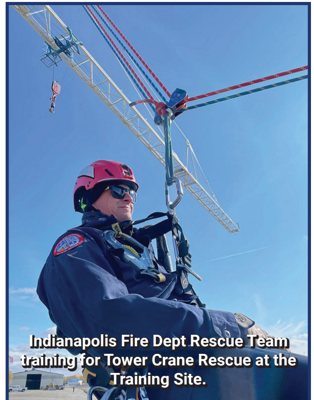
Indianapolis Fire Dept Rescue Team training for Tower Crane Rescue at the Training Site.