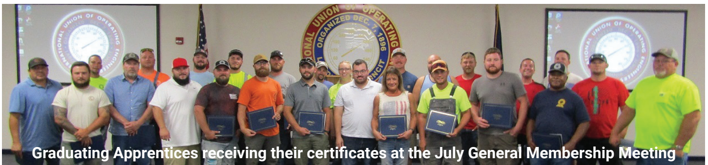
Graduating Apprentices receiving their certificates at the July General Membership Meeting