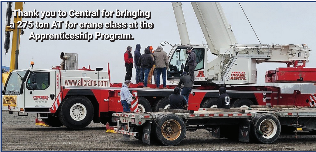
Thank you to Central for bringing a 275 ton AT for crane class at the Apprenticeship Program.

small projects. Fleming is still working on the Decatur sewer project in Adams County. Milestone is still working on the bridge project on 224, just west of Decatur in Adams County.